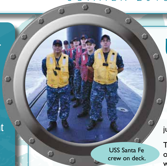
USS Santa Fe crew on deck.