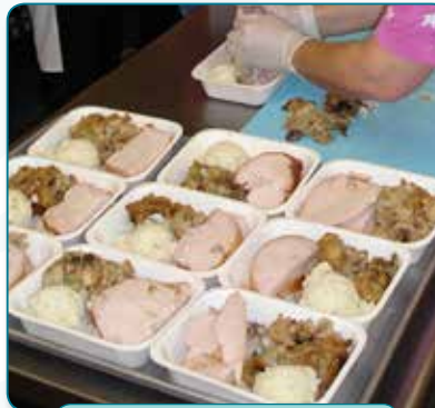
Comfort food at its best.

meals on the cost and consumption of health care services, a 2013 Philadelphia project examined the relationship between home-delivered meals and health care utilization. The Metropolitan Area Neighborhood Nutrition Alliance (MANNA) looked at the health care expenditures of 65 Medicaid-enrolled chronically ill clients over time and compared those expenditures with a similar group of Medicaid patients who did not receive meal delivery services. MANNA is a non-profit organization similar to Kitchen Angels. All health care expenditures were examined both before and after clients began receiving services.