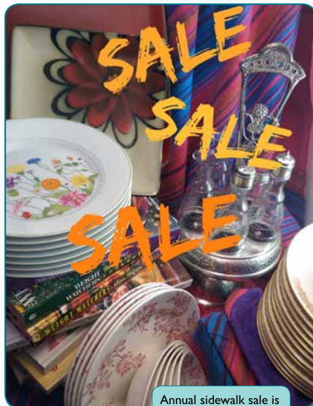
Annual sidewalk sale is Saturday, 13 May.