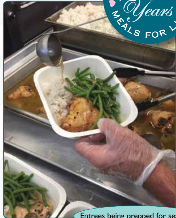
Entrees being prepped for sealing.

In 25 years, we've never turned away a client who met our eligibility and we've never had a waiting list for service. We remain dedicated to helping improve the quality of life for some of the most fragile and vulnerable individuals in our community and to making sure that those who need help