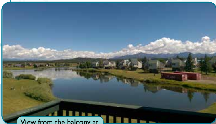
View from the balcony at Eagle's Loft.

This is your chance to win a one week stay at Eagle's Loft timeshare property just west of Pagosa Springs, Colorado. Imagine yourself and your family enjoying a panoramic view of the San Juan Mountains from your private deck at the edge of a small sylvan lake. The Eagle's Loft, a Wyndam Resort timeshare property, is a three-story detached condo which sleeps up to eight people in three