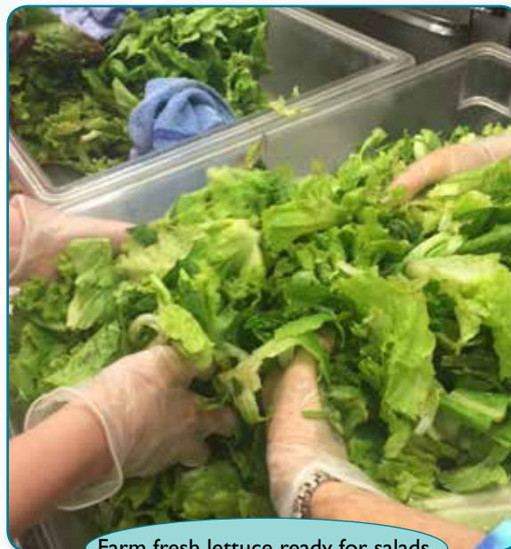
Farm fresh lettuce ready for salads.

securing consistent and reliable nutrition never go without.