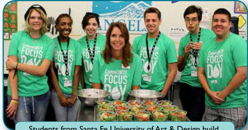
Students from Santa Fe University of Art & Design build camaraderie and learn about the benefits of volunteering at a recent Community Focus Day.